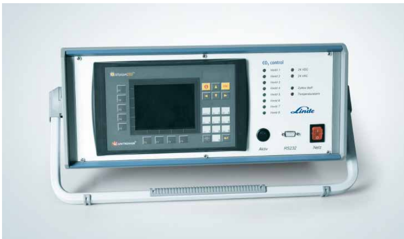
The CO 2 control device for PLASTINUM Temp S enables easy adaptation of the CO 2 cooling parameters to the process.