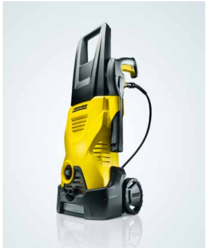
Föhl uses PLASTINUM Temp S to produce plastic components for Kärcher® pressure washers.