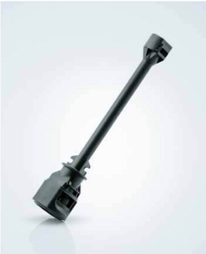
Kärcher pressure washer part, created using PLASTINUM Temp S technology.